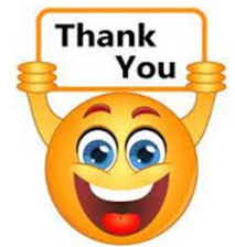
Plate: €1,140; Offerings: €940; Renovation Fund: €1,490. Thanks to all who are so generous.

Copies of the questionnaire are available at the entrances to the Church please take one and reflect on the questions and have your say. If you wish to add any other comments you can use more paper and attach it.